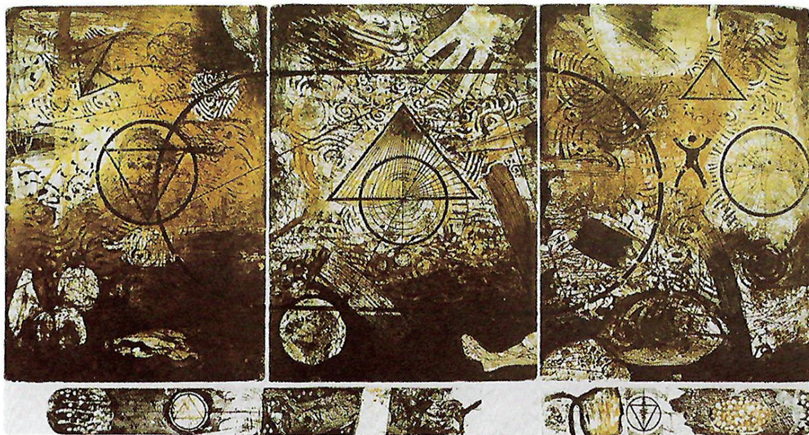
Image of Life and Time 14 Media etching